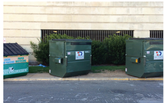
Obstacles force pedestrians into the street.