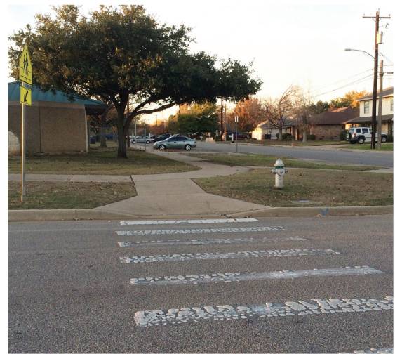
Faded crosswalk markings reduces visibility of pedestrian crossings.